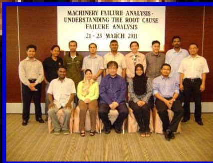
RCFA Master Class March 21 to 23, 2011 Glenmarie Holiday Inn, Malaysia