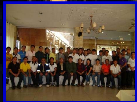
RCFA Master Class May 11 to 13, 2011 EDC, Ormoc, Philippines