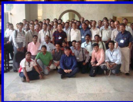
RCFA Master Class Sept. 30 to October 2, 2010 Mumbai, India