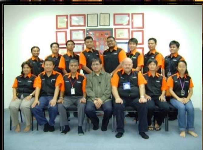
Approved Group Sdn. Ltd. Forensic Group, Malaysia June 2011