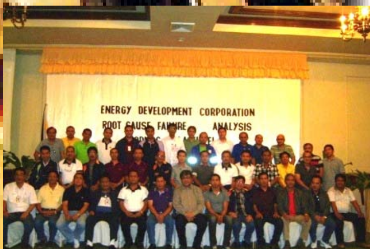
RCFA Master Class, Energy Development Corporation, Ormoc, Philippines. July 2011